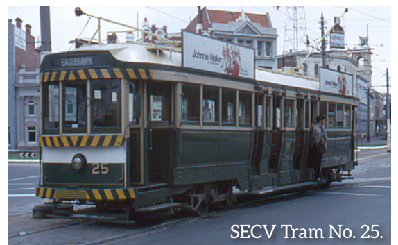
SECV Tram No. 25.

Tram No. 25 was selected as one of four cars to inaugurate the Vintage Talking Tram service.